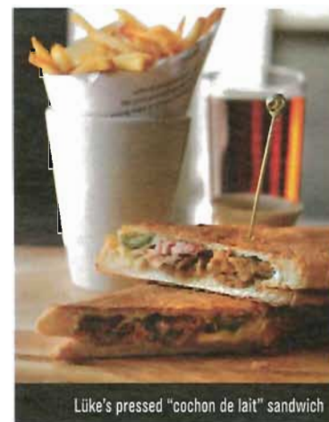
Lüke's pressed "cochon de lait" sandwich

While some Lone Star chefs crash the capital, a New Orleans star shines in San Antonio